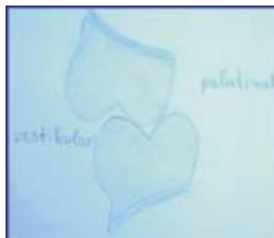
Fig. 4. Lingualized occlusion