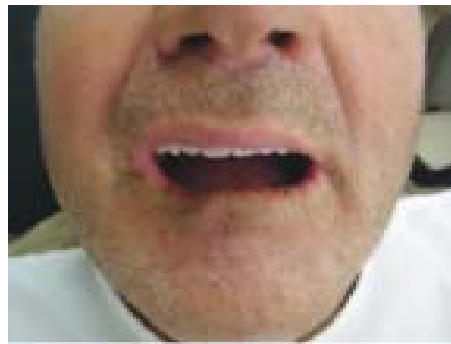
Fig. 2. Correct occlusal plane

We measured first the rest vertical dimension and then reduce it to the occlusal vertical dimension with 2-4 mm. To record the centric relation we remove about 3 mm of the mandibular rim from the first premolar distally to the end of the wax rim both on the right and the left sides. On the maxillary rim in the corresponding areas we cut two or three notches. /3, 4/ At this appointment the size, form and the color of the teeth is chosen, according patients desire and our recommendations. We used "Ivostar" (Ivoclar, Vivadent AG) frontal teeth.