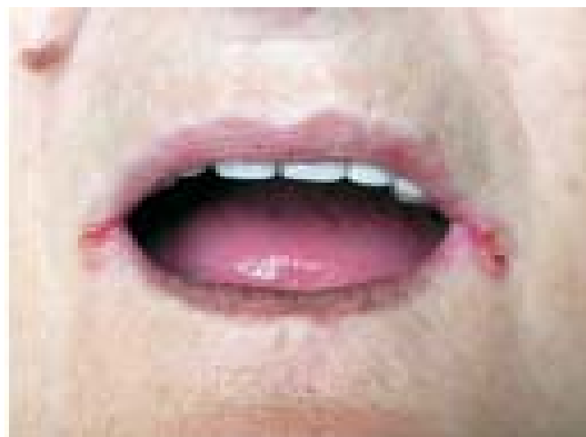
Fig. 3 Angulus oris