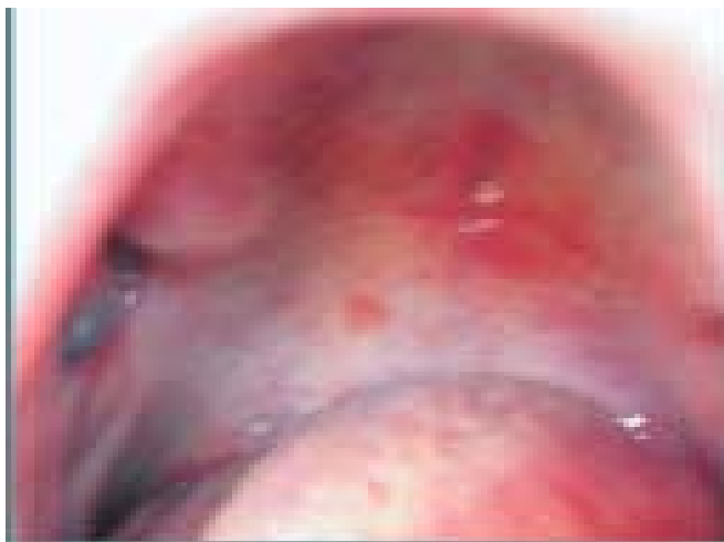
Fig. 1 Slight inflammation

From all 300 patients we observed 54 patients with denture stomatitis (18%), 39 women (72,22%) and 15 men (27,78%). Only 6 women (11,11%) with denture stomatitis complained of slight burning and itching sensation, especially provoked by intake of hot and spicy food. Four women and two man (11,11%) had severe inflammation of the palate, with marked papillomatosis and angulus oris. /Fig.4 and Fig 3/. Twelve women and six men were with moderate stomatitis (33,33%) / Fig 2/ nineteen women and eleven men were with slight inflammation (55,56%). / Fig.1/