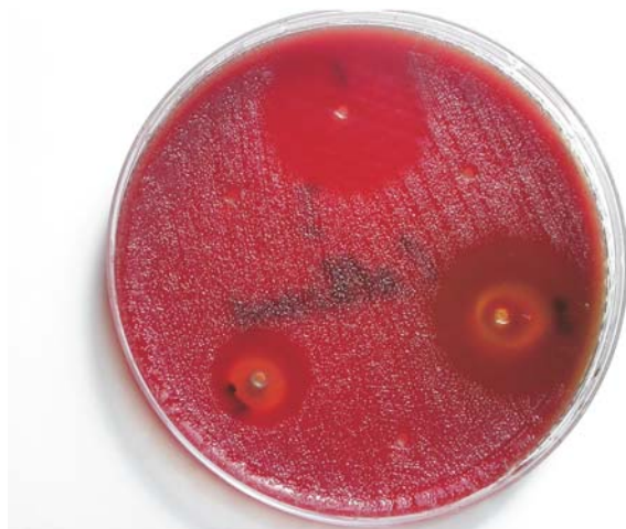
Fig. 2. Zones of suppression of bacterial growth

Max – Maximum diameter of the zones in millimeters