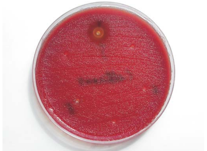
Fig. 3. Zones of suppression of bacterial growth