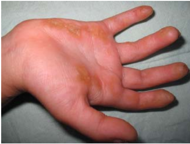
Fig. 4. Patchy palmar hyperkeratosis at the age of three.