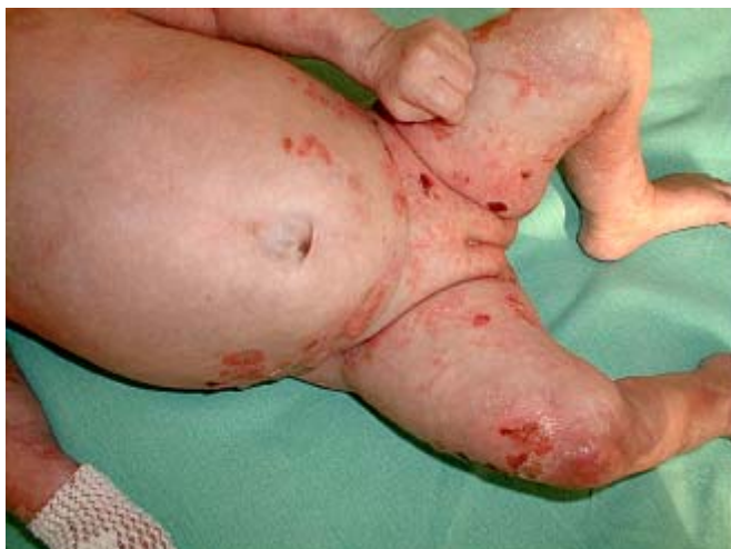
Fig. 1. Multiple herpetiform grouped bullous and erosive lesions on the trunk and lower limbs and slight atrophic scars.

In conclusion the EBS Dowling-Meara case we described above demonstrates severe blistering at birth and relative benign course of the disease with age. The correct diagnosis is helpful in the prognostic assessment of the disease and in the medical and genetic advice for the parents.