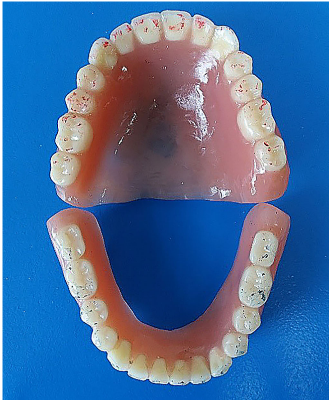
Fig. 4. Registered occlusal contacts with articulation paper.

The null hypothesis was partially accepted. Data about OHIP-EDENT were similar for both groups of patients digital T-Scan articulation and conventional articulated dentures. However, digital dentures showed better results in comfort, retention, and satisfaction. In addition, fewer follow-up sessions were needed for dentures articulated with the T-Scan system.