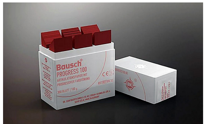
Fig. 2. Articulation paper 100 µ

In the second group, a conventional technique with Bausch articulating paper 100 µ [PROGRESS 100 Microns Articulating Paper with Progressive Color Transfer, Bausch Articulating Papers, Inc., USA, 1998] was used for articulating the total patients [Figure 2]. This 100-micron paper is impregnated with hydrophilic waxes and pharmaceutical oils. This unique combination with the bonding agent Transculase® enhances the detection of high spots on hard to locate surfaces, such as highly polished metals or ceramics. Its hydrophilic properties make it advantageous for use on moist occlusal surfaces – a highly desirable attribute. On the occlusal surface of teeth, many marks of different sizes and intensities of the coloring are obtained. Analysis of occlusal contact strength is subjective.