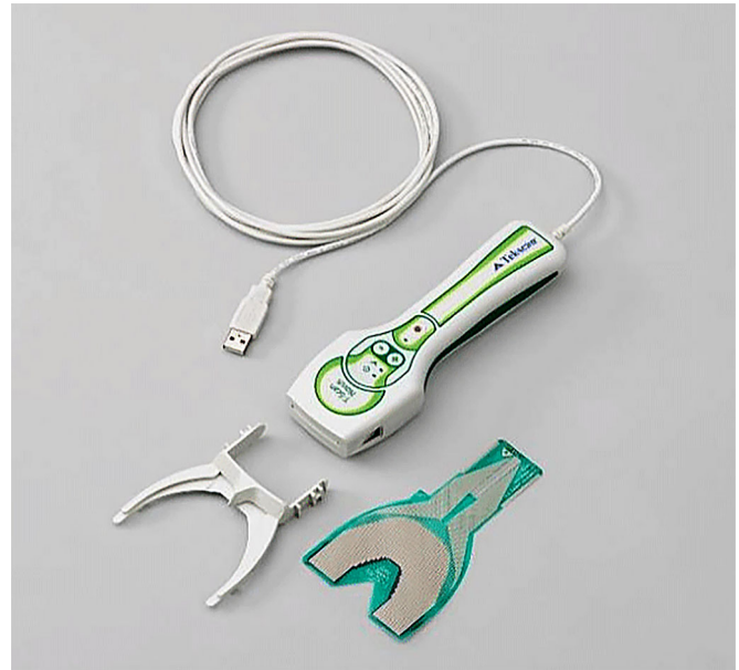
Fig. 1. T-Scan Novus Digital Occlusal Analysis System

In the second group, a conventional technique with Bausch articulating paper 100 µ [PROGRESS 100 Microns Articulating Paper with Progressive Color Transfer, Bausch Articulating Papers, Inc., USA, 1998] was used for articulating the total patients [Figure 2]. This 100-micron paper is impregnated with hydrophilic waxes and pharmaceutical oils. This unique combination with the bonding agent Transculase® enhances the detection of high spots on hard to locate surfaces, such as highly polished metals or ceramics. Its hydrophilic properties make it advantageous for use on moist occlusal surfaces – a highly desirable attribute. On the occlusal surface of teeth, many marks of different sizes and intensities of the coloring are obtained. Analysis of occlusal contact strength is subjective.