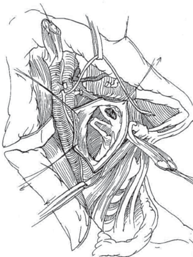
Fig. 3. Intraoperative view in our case